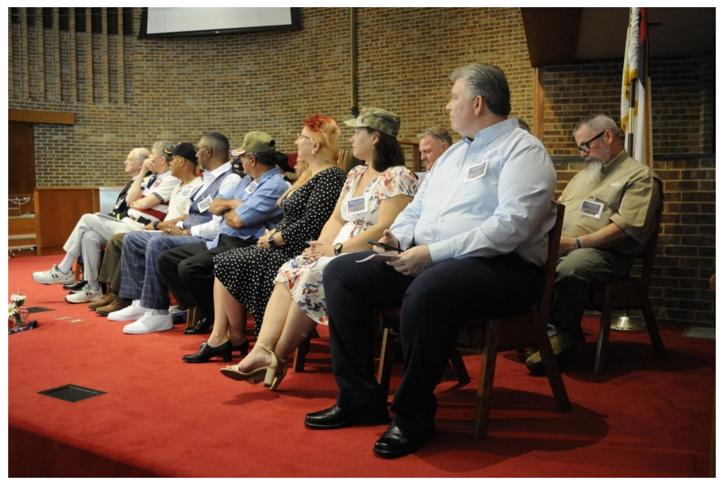
The Quilters Guild of East Texas presented 20 veterans with Quilts of Valor during a ceremony at First Christian Church on July 13.