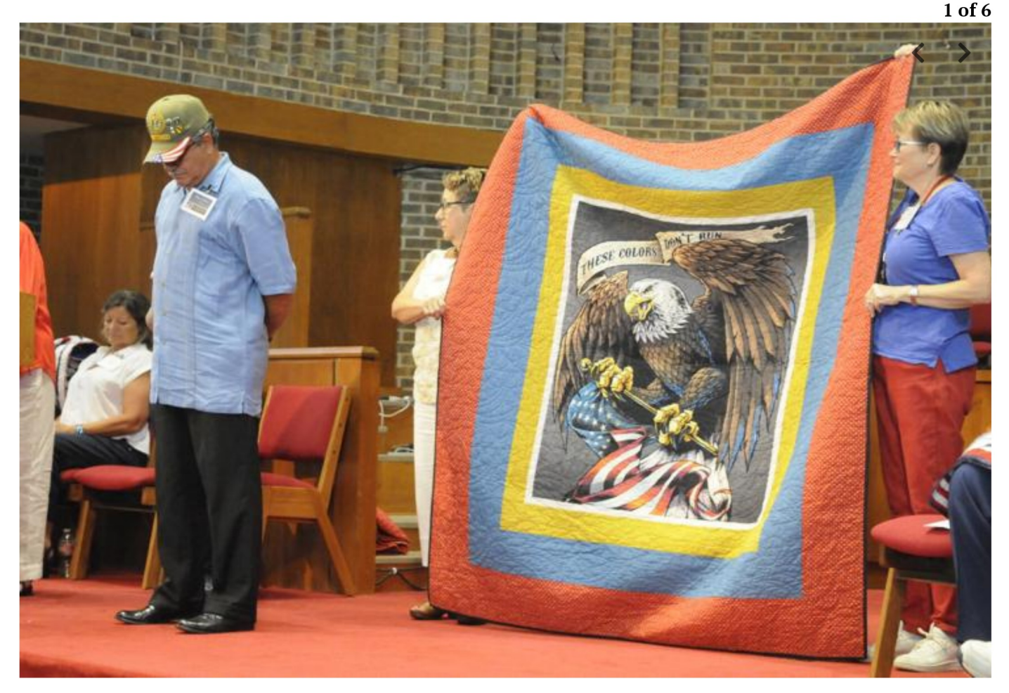
The Quilters Guild of East Texas presented 20 veterans with Quilts of Valor during a ceremony at First Christian Church on July 13. The guild awarded 20 quilts during the twentieth year of Quilts of Valor's founding.